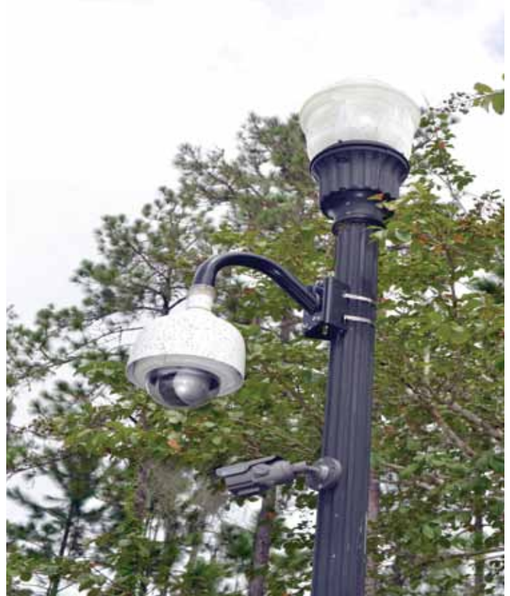
Two of the four cameras in the clubhouse parking lot are pictured above. The HD dome camera is on top and the license plate recognition camera is on bottom.