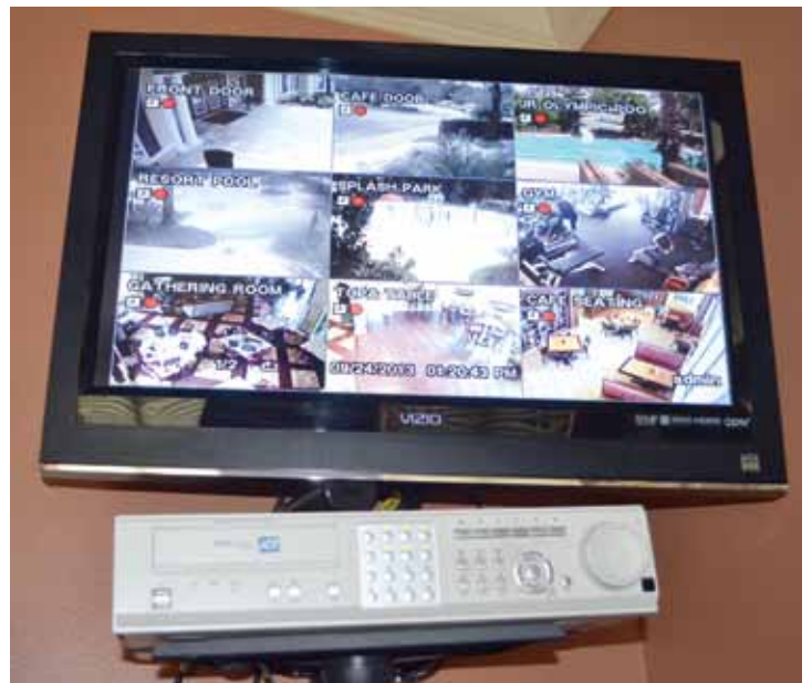
Monitor displaying 9 of the 16 clubhouse ADT cameras simultaneously