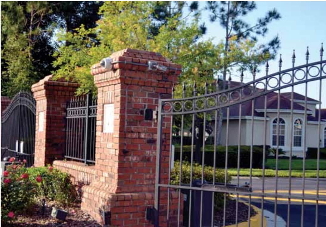
Security cameras at Shoregrass entrance. Neighborhoods with gates have the cameras mounted on the gate post.

In summary, the CDD paid Securiteam $85,997 for 29 cameras for the neighborhood entrances and the clubhouse parking/pool during 2011/2012 to augment the 16 clubhouse ADT cameras installed in 2003. ♦